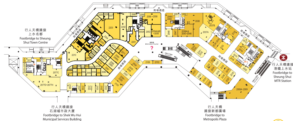
L2 平面圖 Floor Plan

The mall is approximately 120,000 sq. ft. over 2-floor retail area. It offers a wide range of area and layout choices.